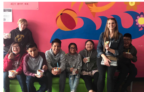
Spring Field Trips: Students brought their learning beyond the classroom with field trips to the Aquatic Center, Children's Library, Santa Fe, and Explora Science Center. Eighth graders also visited Rehoboth Christian High School!