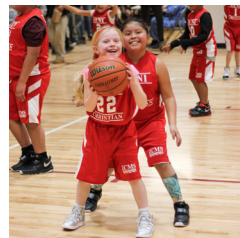
Cubs and Cougars: Our mid school Cougars and elementary Cubs had a great season ending with staff vs. student and student vs. parent games.