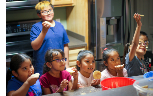
Summer School: Summer school students learned about poetry and cooking with hands on activities!