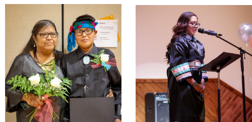
Graduation: Pray for our seven mid school graduates as they take their next steps to high school.